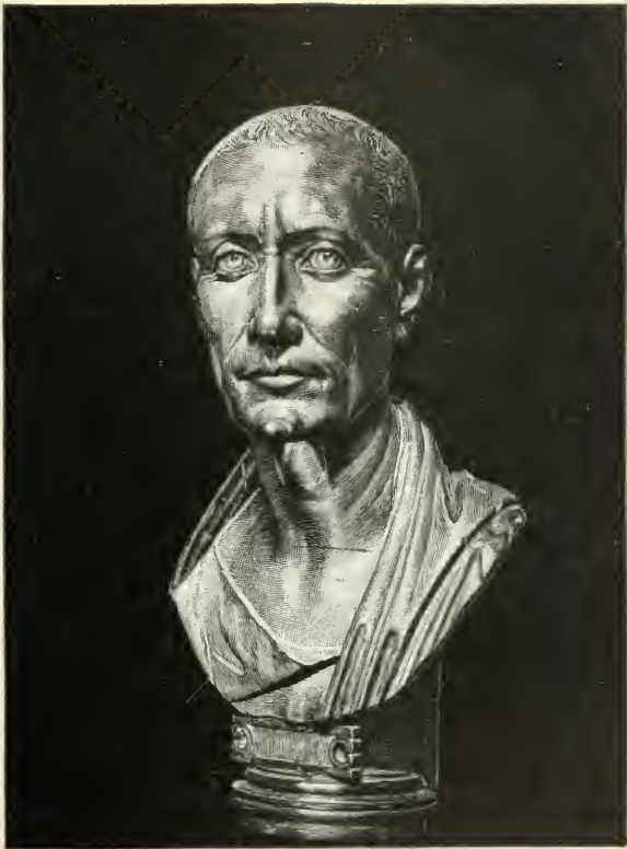
JULIUS CÆSAR Bronze bust in the Berlin Museum.