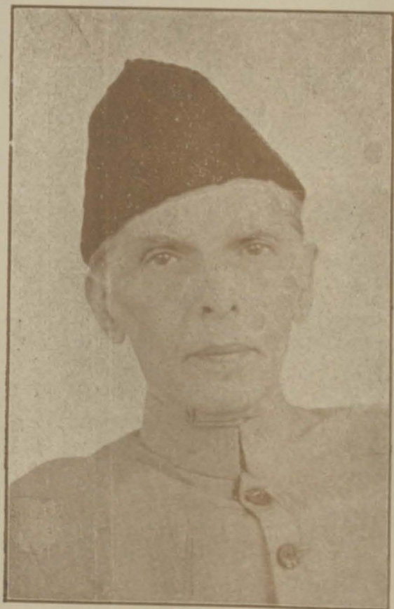
QAID-I-AZAM MOHAMMAD ALI JINNAH